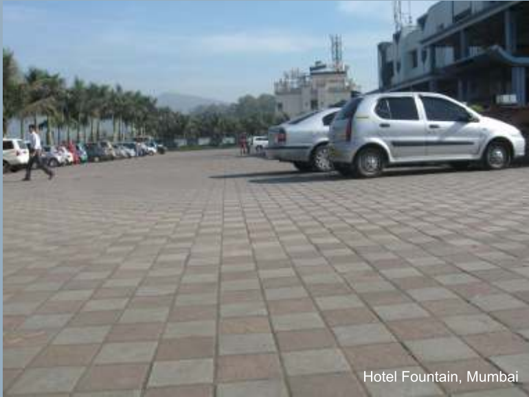
Hotel Fountain, Mumbai