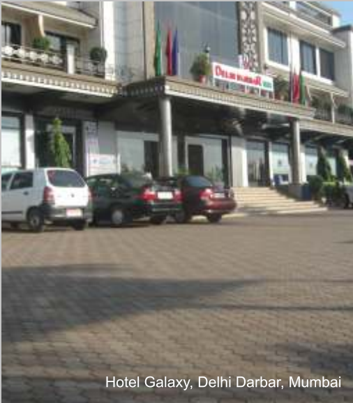
Hotel Galaxy, Delhi Darbar, Mumbai