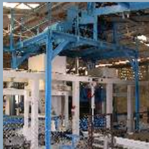
Rekers Block Plant