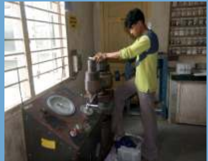
Complete in-house conformance testing