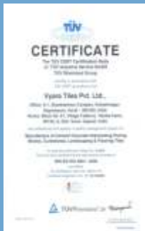
ISO 9001:2008 certified