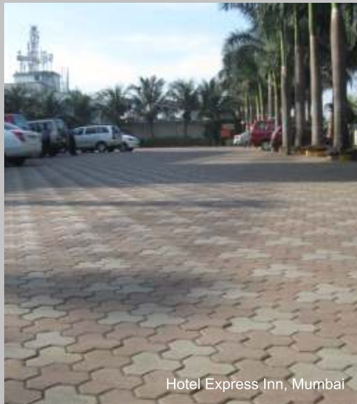
Hotel Express Inn, Mumbai