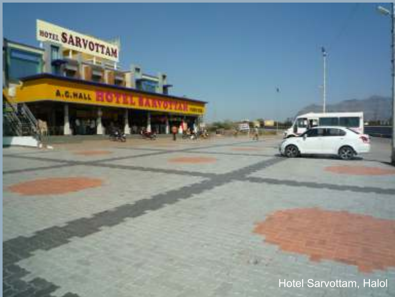
Hotel Sarvottam, Halol