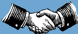
Value based and ethical organization