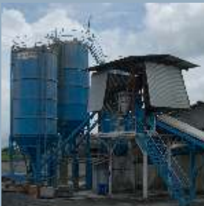
Weigh Batching & Mixing

Your product is tested and quality checked, whether you have asked for it or not