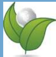
Environment friendly organization.